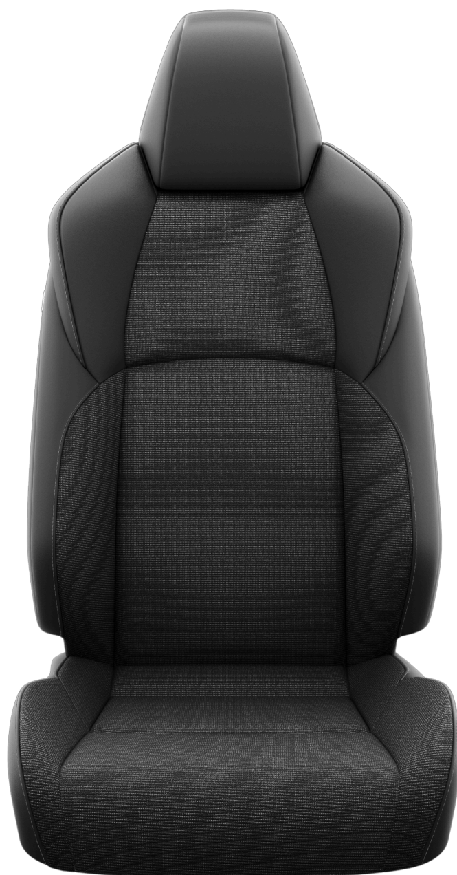
Fabric Seats with Black Synthetic Leather Bolsters (EB20)