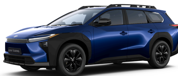
Azure Blue (D33)***

Non-Metallic* Metallic ** Pearlescent ***