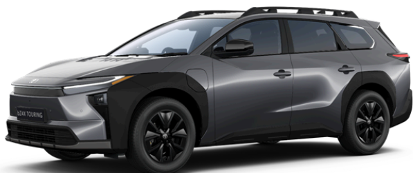
Magnetite Gray (D31) **