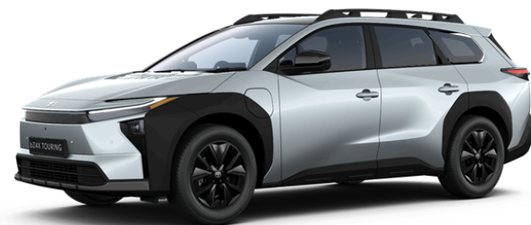
Ice Silver (D30) **