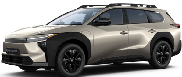
Brilliant Bronze (D35) **