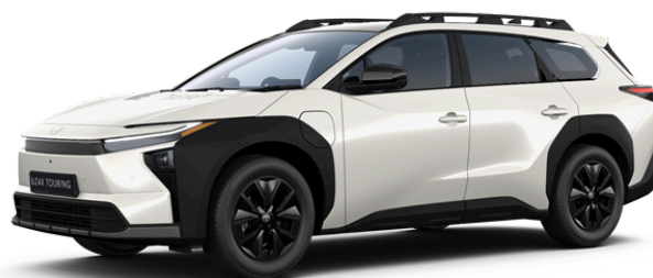
Crystal White (D29) ***