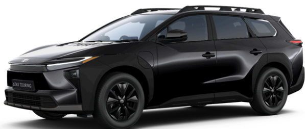
Crystal Black (D32) *